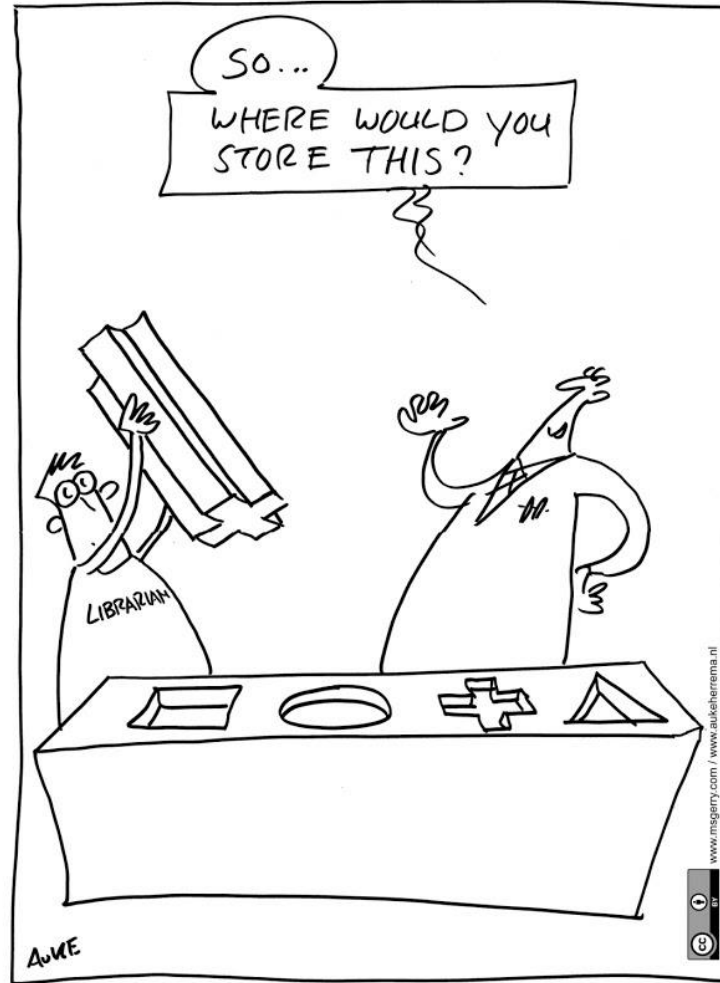
LEARNING HOW TO ARCHIVE DATA