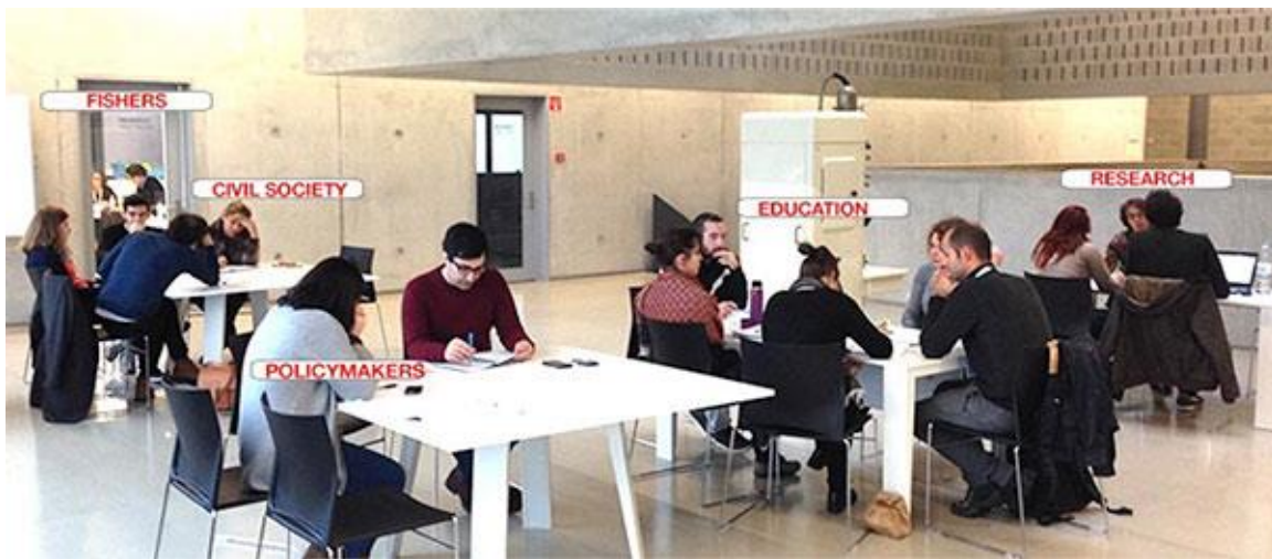
Workshop: Stakeholder Engagement in Research I3S | University of Porto | February 2016