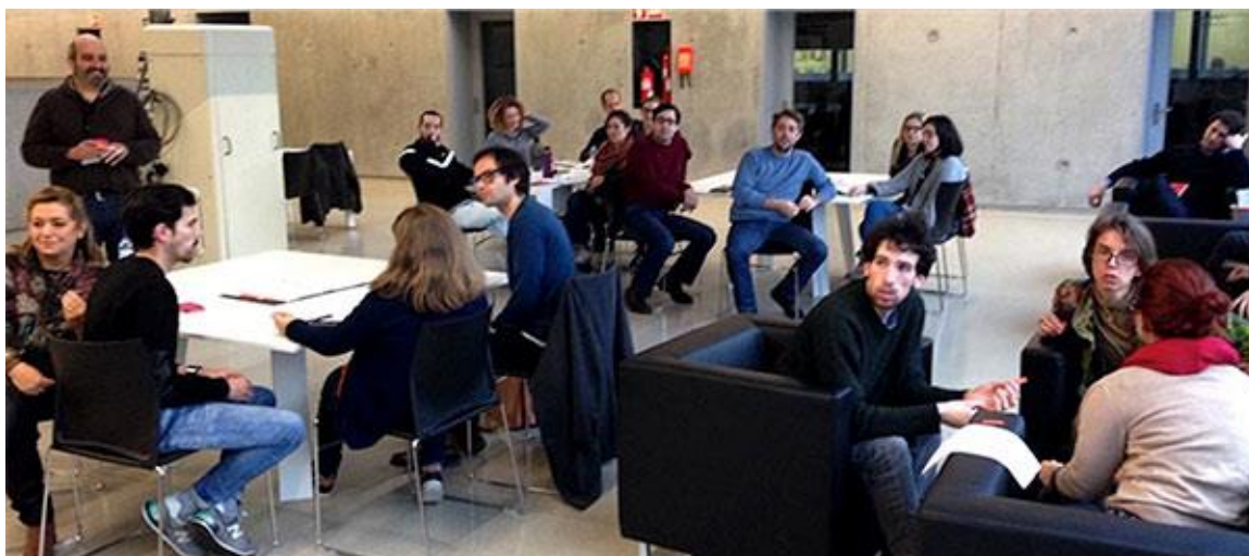
Workshop: Stakeholder Engagement in Research I3S | University of Porto | February 2016

Prepared by the discussions held in their own stakeholder group – even if these did not lead to complete agreement – representatives bring their group’s positive ideas to the meeting for discussion, arguing to ensure that these are taken into consideration and revising their viewpoints in the light of arguments from other groups.